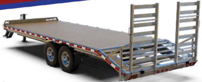
DKO20-3-14 shown subject to change