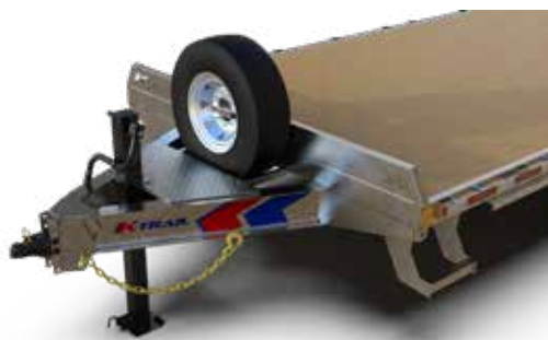
INTEGRATED SPARE TIRE MOUNT