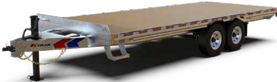
DKO20-14 shown subject to change